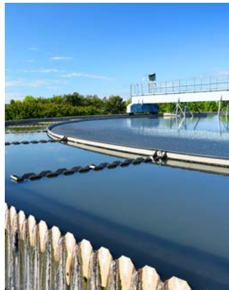
Water & Wastewater